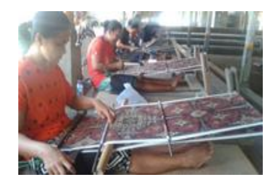
Figure 4. Weaver Community of Tenganan Pegringsingan Traditional Village (Control Group and Treatment Group) 25

Weaving job need accuracy since the tools is operated by each women worker with high sight accuracy. So it needs eyeglasses to operate, beside to avoid the eyes tiredness it is also to avoid the thread dust get in into their eyes, hence the products become maximum result <sup>26</sup> <sup>27</sup>. For one unit of Control Group (C) weavers, founded that average production of cloth daily in existing old position is 349,68 (±111,79) cm2. This is different with the job using new working position, where one