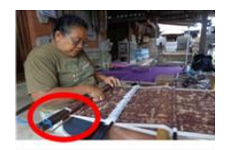
Figure 1. The Process of Weaving Old Work Attitudes (Without Improvement)<sup>7</sup>

Through a participatory approach to the workers and operator ( Kelian Banjar Tengah Tegeh Tenganan Pegringsingan ), there are some alternatives in order to reduce subjective complaints and the way to increase productivity, such as improving work attitudes by adding supporting equipment: 1). Using eyeglasses, 2). Using barbel on fingers during rest time, 3). Using tingklik short stool, 4). Adding kapok cushion on por and 5). Using pelipir . The attitude improvement alternative by adding supporting equipments was chosen because considered easy to do, also by their request, hence it could reduce subjective complaints and increase productivity.