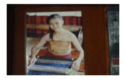
Figure 3. Weaving Process With Improved Work Attitudes and Ergonomic Aids<sup>22</sup>

Resting pulse per minute, Working pulse per minute, Recovery pulse per minute, and Work pulse per minute in control (weaving in existing old position) and treated (weaving with supporting equipments position peliper , por with foam cushion, using eyeglasses and massaging barbell during rest time) shown in Table 4.