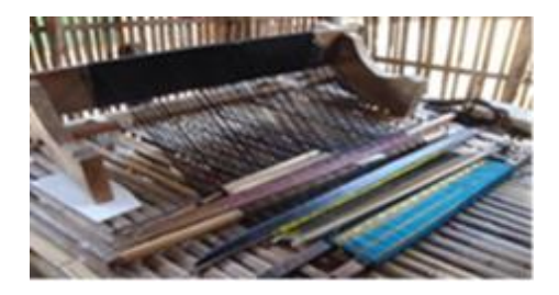
Figure 2. A set of looms with thread arrangements that have been haned8